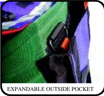
EXPANDABLE OUTSIDE POCKET