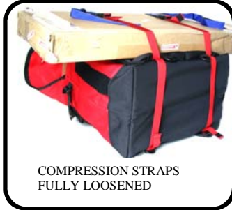
COMPRESSION STRAPS FULLY LOOSEMED