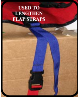
USED TO LENGTHEN FLAP STRAPS