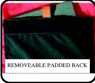
REMOVEABLE PADDED BACK