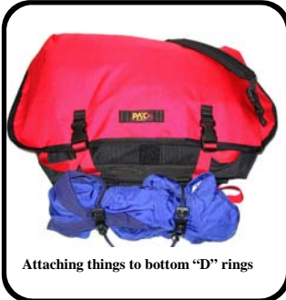
Attaching things to bottom "D" rings