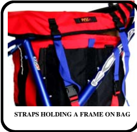
STRAPS HOLDING A FRAME ON BAG