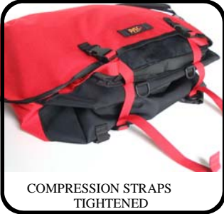
COMPRESSION STRAPS TIGHTENED

Inside the bag you will be able to see your items in the LARGE MESH POCKET . For items that you want to keep separate keep them inside the COLLAPSABLE DIVIDER , which you can keep pushed to the back of the bag when you don't need it. Behind the Divider, in the rearmost pocket, you will find the removable PADDED BACK , it is recommended that you keep the padded back in it's place to keep those pokey things from jabbing you but it's nice to be able to take it out for an insulated seat on those frosty winter days.